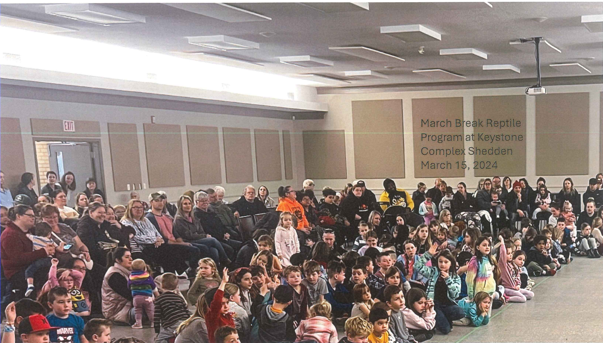
March Break Reptile Program at Keystone Complex Shedden March 15, 2024